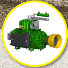
Autonomous filling and emptying with a vacuum pump