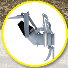
Spreading with exact scatterer